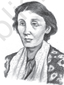
Virginia Woolf 1882-1941

This essay records fleeting impressions and delicate shades of mental experience.